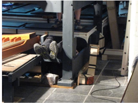
Killed in action