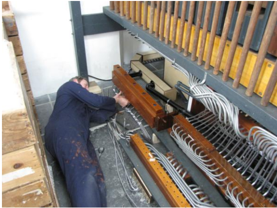
Another man down