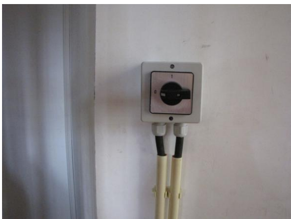
Warning: this operates the organ only, not the vicar