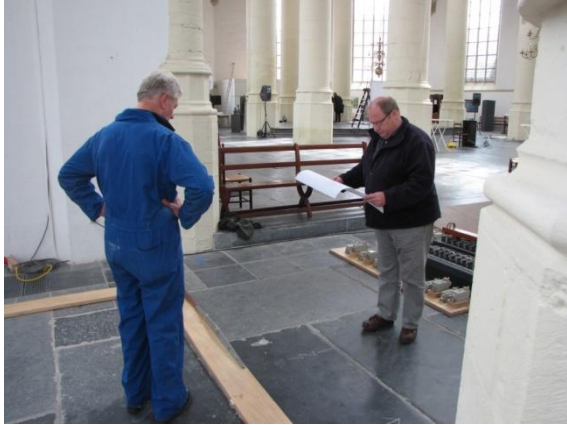
“Whoops....they have a metric system here....”