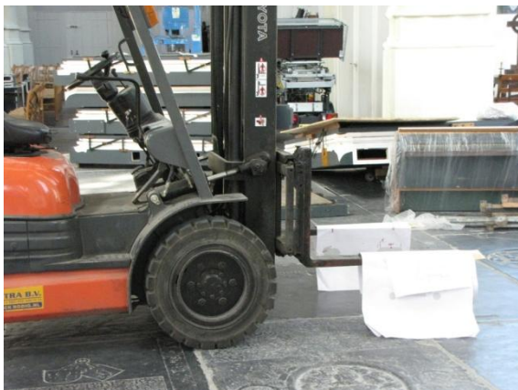
Heavy technical drawings