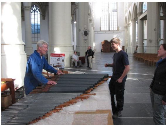
“I bought myself a xylophone”