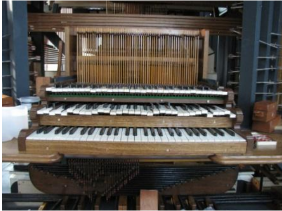
For any drunk organist