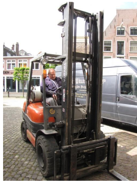
“Well, it’s not a Rolls Royce Phantom...”