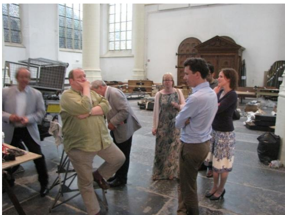
“Meantone temperament? Sounds like an idea”