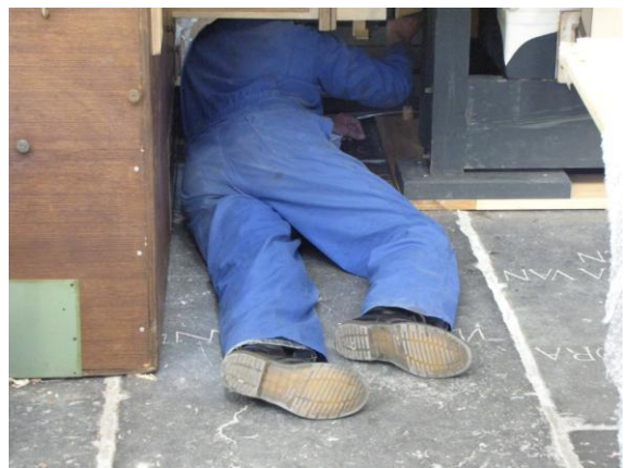
And that makes three men down