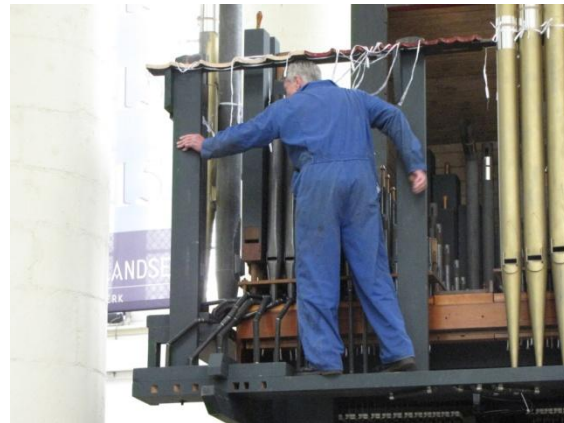
More English safety procedures