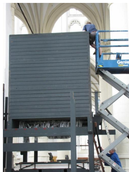
English safety procedure