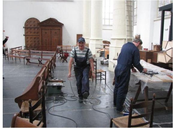
Some fitness exercise